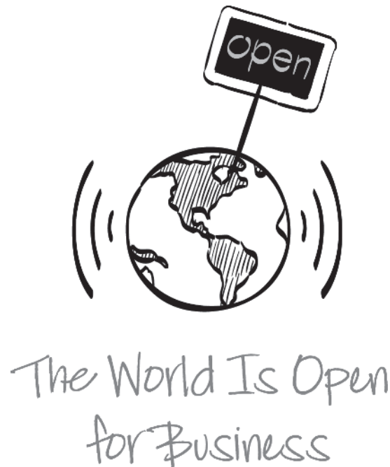
Figure 1.3 Everywhere commerce turns shopping inside out. Purchasing can take place anywhere or any time a consumer has access to a screen. By 2017, mobile commerce will account for 26 percent of U.S. retail e-commerce sales (eMarketer).

the word campaign —implying a long, concerted effort—may no longer apply. It's more about marketing interactions —small, focused, agile efforts aimed at achieving a near-term goal while building deeper, long-term customer connections.