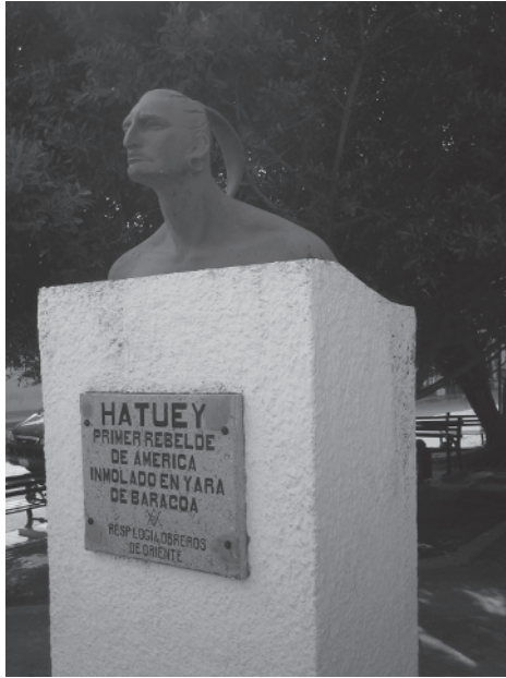
Figure 1.1 Bust of Hatuey in the main plaza of Baracoa in eastern Cuba. “Hatuey: The First Rebel of America. Burned at the Stake in Yara, Baracoa.” Oriente Workers Lodge.

(Some of these words, like hurricane , barbecue , and canoe , also made their way into English.) By choice or by force, indigenous women intermarried and reproduced with Spanish men. Indigenous foods and customs shaped the Spanish-dominated culture that emerged on the island. 2