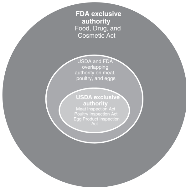
FIGURE 1.2 Overlapping statutory authorities.

and Drug Administration is responsible for all meats considered “exotic,” including venison and buffalo (see Figure 1.2).