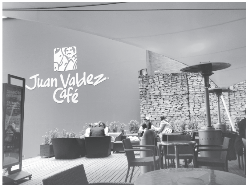
The Juan Valdez Café, Bogotá, Colombia.

"No." The barista behind the counter shakes her head, which is topped with a maroon hat that matches her maroon apron. She is holding the biggest cup of coffee they serve at the Juan Valdez Café in Bogota, Colombia—a cup that looks like it would barely hold a double shot of espresso. It's not even close to the size of a short coffee at Starbucks, which only holds eight ounces. And who drinks only eight ounces of coffee these days?