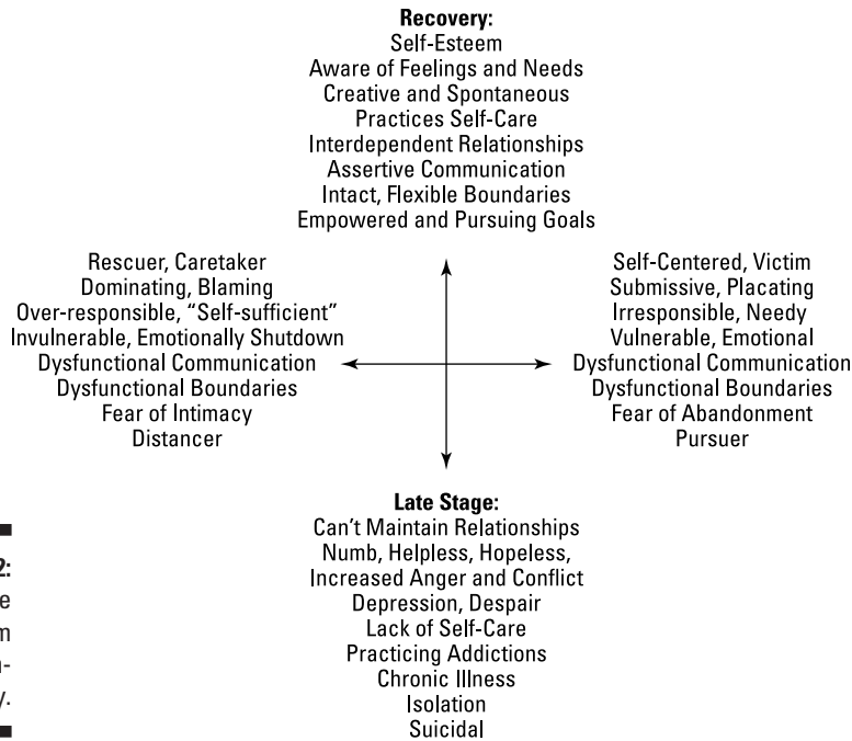
Figure 1-2: The continuum of codepen- dency.