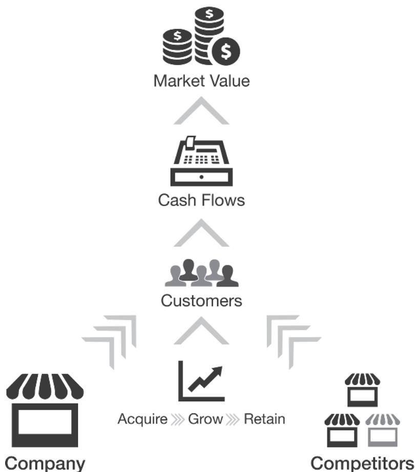
Figure 1.3 Customers Are Key to Market Value