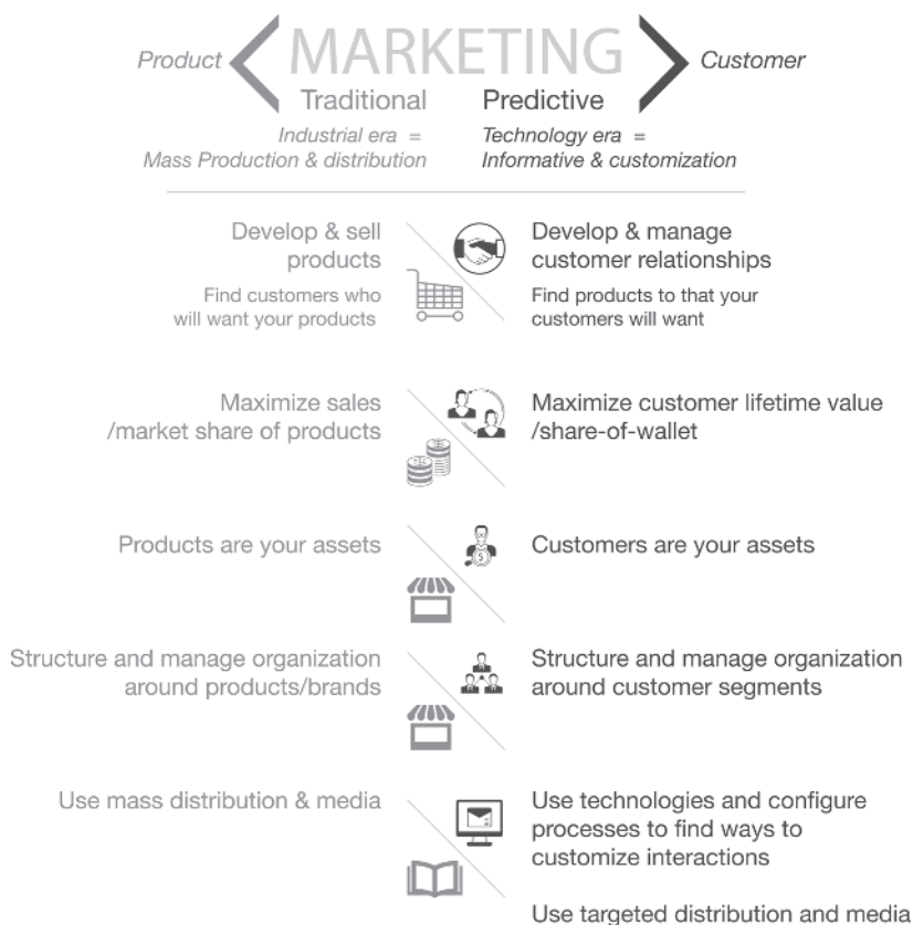
Figure 1.2 From a Product to a Customer Orientation

with your brand, allows you to serve your customers better and generate more sales. At its core, as Figure 1.2 illustrates, predictive marketing is helping companies to evolve from a product- or channel-centric orientation to a customer-centric orientation. Companies using predictive marketing focus on developing and managing customer relationships rather than just developing and selling products or channels: