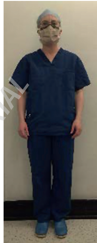
Figure 1.2 Before scrubbing, don hat, mask, eye protection.