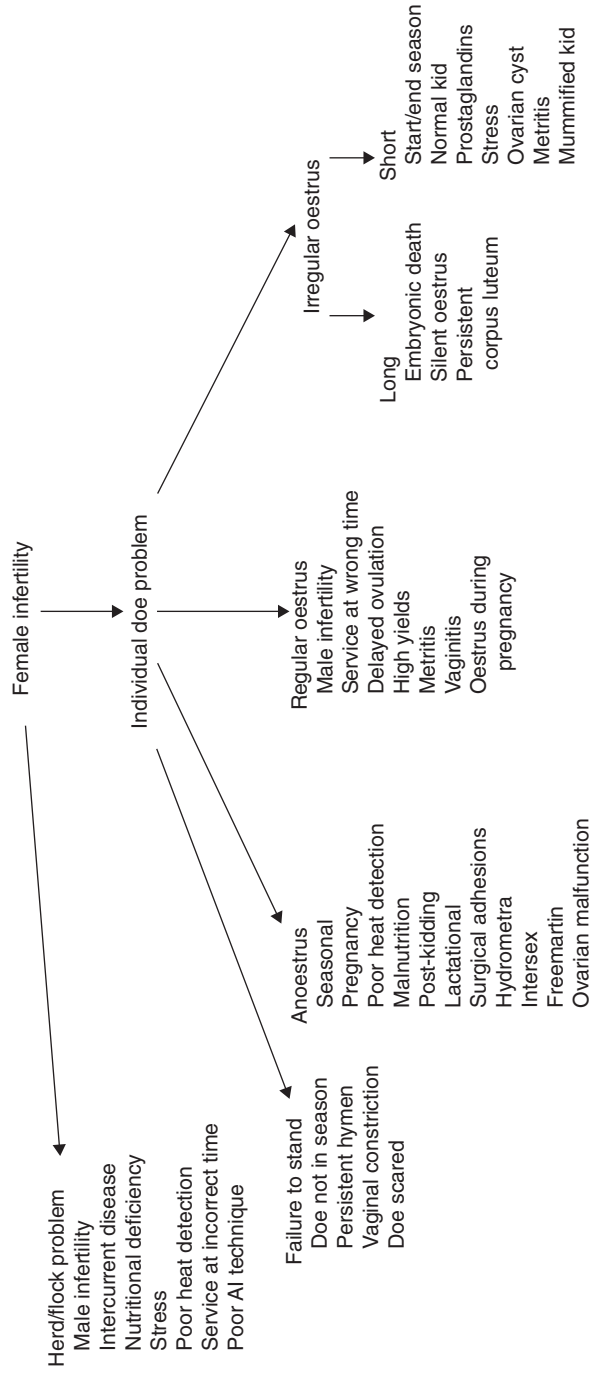
Figure 1.1 Causes of female infertility.