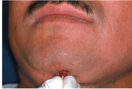
Figure 1.3 Cutaneous odontogenic fistula.