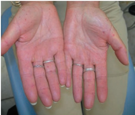
Figure 1.5 Hereditary hemorrhagic telangiectasia (same patient as in Figure 1.2).