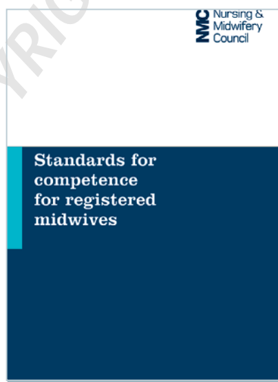
Figure 1.5 Standards for competence for registered midwives.