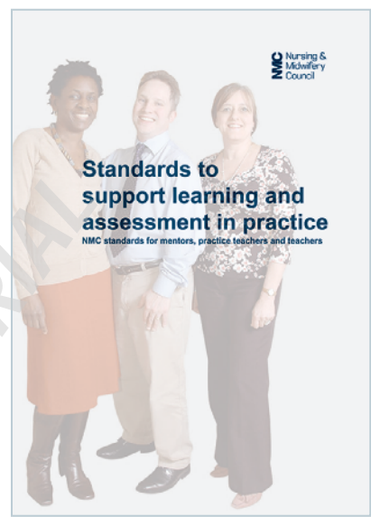
Figure 1.3 Standards to support learning and assessment in practice.