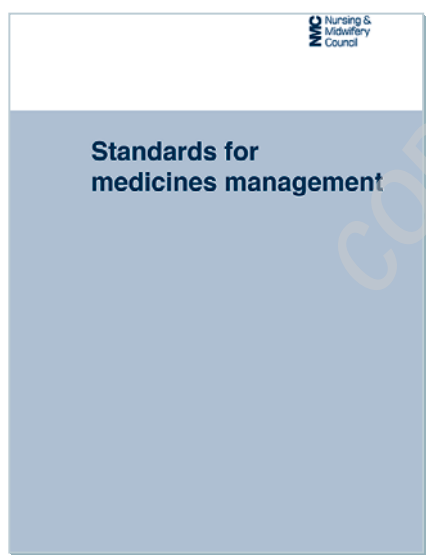
Figure 1.4 Standards for medicines management.