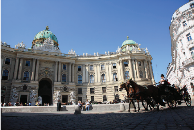
Figure 1.6 A horse and buggy ride in front of Hofburg Palace, Vienna. Tourist spaces often include elements that connect places to moments in the past.

What is a tourist space ? Within cities, we find highly controlled areas that cater specifically to the experiential, consumption, service, and aesthetic demands of tourists. They allow visitors to engage with a place's positive associations in a highly controlled environment. Informed by tourist literature and local iconography, tourism promoters essentially “script” the impression a tourist is to take away from a place. Thus, in Rome or Paris the tourist revels in culture and art, while in Jamaica or Cancun the script emphasizes tropical relaxation. Care is taken to ensure the harmony of the message, typically by removing any contradictory elements. Thus, a resort district may wall off views of nearby slums, and street vendors might be carefully controlled around museums and monuments. However, slum tourism in India's megacities (mentioned earlier in this chapter) appears to fit both in an ironic way.