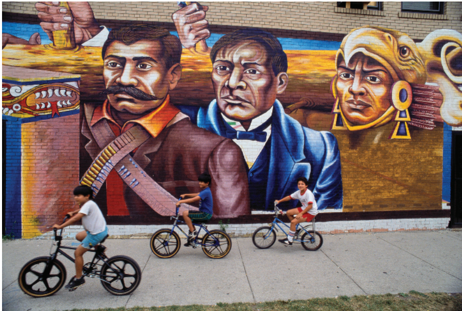
Figure 1.5 Murals in Chicago's Pilsen neighborhood announce – and enhance – the area's Mexican heritage.

priorities, how they care for their children, and other important matters. In 2010, a conflict over the construction of an Islamic center and mosque near the site of the former World Trade Center provides a useful illustration here. Had the area never been the target of terrorist attacks, the proposed mosque might have proceeded with little notice. But, because the area now possesses a near-sacred status, and because that status is bound up with the identity of the terrorists, in the minds of some New Yorkers the construction of a mosque nearby constituted another assault. Those supporting and opposing the mosque struggle to attach their preferred meaning to Lower Manhattan as a place: some supporters have argued that a mosque nearby would serve as a testament to US tolerance and diversity, while those opposing the development contend that it would mock the memories of those who perished nearby. Although this is a dramatic example, the meanings of all places are subject to change, whether by deliberate action or by accident. Changes in meaning are then literally cast in concrete when one type of structure or another is deemed appropriate and constructed.