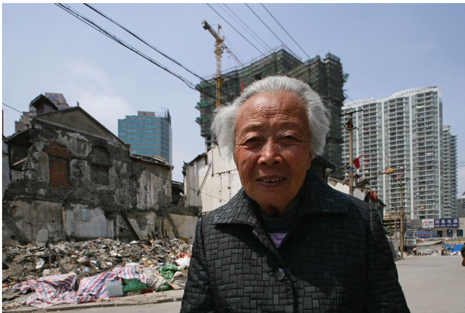
Figure 1.2 Redevelopment in the older areas of Shanghai has displaced an estimated one million households. This woman was one of the last remaining residents in her neighborhood, having refused to relocate.

Though personal and sentimental meanings such as these are certainly important, individuals and groups attach meanings to places of much larger scales, and with much higher stakes. This can best be illustrated by the large-scale urban redevelopment over the last two decades in Shanghai, where people on entire blocks of old houses, primarily located in the urban core, have had to relocate due to the new construction of more lucrative commercial and residential projects (see Figure 1.2). An estimated one million households and up to three million people have lost their attachments to their old residences and neighborhoods. Without sufficient compensation from the government and developers, many of these displaced residents have experienced both the financial strain of buying the new and more expensive high-rise housing away from the city center and the difficulty of accessing convenient shopping and services. More importantly, however, they have lost the emotional attachments to, and social networks in, the old neighborhoods that once were manifest in convenient daily encounters and casual chats across the alleys and on the street. This loss took a much heavier toll on older people, who were much more strongly and deeply attached to the old houses and neighborhoods as places (see Chapter 12).