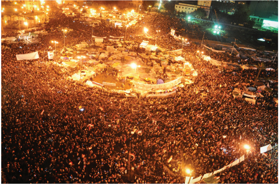
Figure 1.4 Cairo's Tahrir Square – during the Egyptian uprising of 2011, when as many as one million protestors would gather there. This public space became a crucial site for organizing and communicating, and it became a symbol for the movement itself. In other countries experiencing the Arab Spring uprisings, public spaces also played key roles, such as the make-do use of a traffic circle in Bahrain.

occurred in the former Yugoslavia are a prime example, as are the sectarian struggles in Iraq. The war in Syria has displaced some 10 million people – 6.5 million who remain within the country but have lost their homes, and over four million who have fled to other countries (UNHCR 2015). Environmental forces also threaten the security of places, whether the potential flooding of coastal areas due to climate change or more routine disasters such as earthquakes, wildfires, and seasonal flooding (see Chapter 13). Whatever the threat to security, it is important to keep in mind that when people lose the places to which they are attached they lose much more than their physical environment: they also lose the potential of that environment to generate a positive identity or community. For that reason, displacement is among the most disruptive events that an individual can experience.