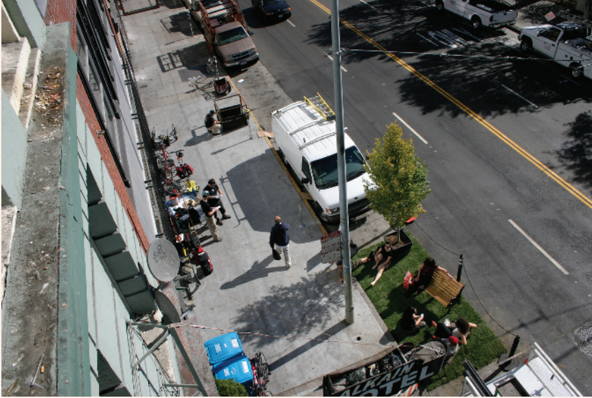
Figure 1.7 The addition of grass and benches converts a San Francisco parking place to a park as part of 2010's PARK(ing) Day.

formal counts), 975 parks were created in 162 cities in 35 countries (see Figure 1.7). People have used PARK(ing) Day to create parks in their own cities and to provide other types of services at the park as well, such as bike repairs, political seminars, and free healthcare clinics.