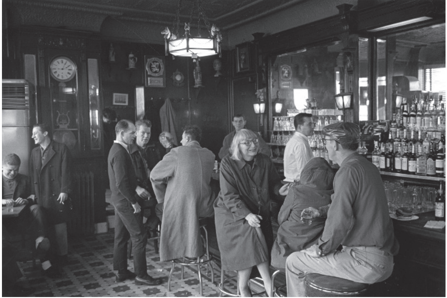
Figure 1.3 Jane Jacobs at the White Horse Tavern in Greenwich Village in 1961. For Jacobs, the neighborhood tavern was an important place for locals and visitors alike to renew connections.

their homes. Moreover, because everyone visited the delicatessen regularly, Joe acted as an important source of information in the community. He even held the keys to various buildings and residences in the neighborhood – a strong indication of the level of trust there.