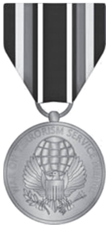
Global War on terrorism medal.