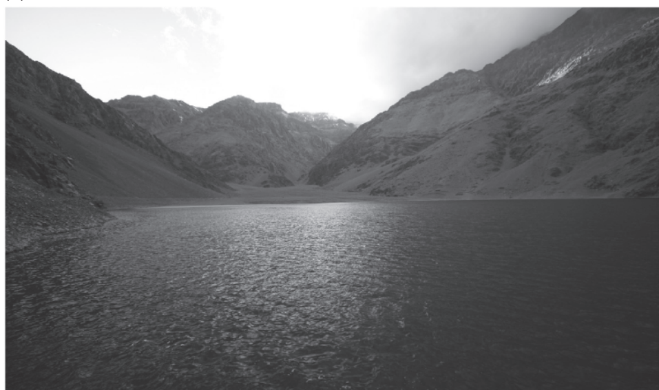
Figure 1.3 Trout lakes in the Atlas Mountains (Morocco). (A) 'Isni' Lake inhabited by the 'green trout', S. pallaryi and (B) 'Ifni' Lake inhabited by the 'dwarf trout', S. akairo .