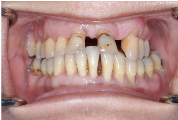
Figure 1.1 Preoperative clinical photograph.

A 34-year-old female patient was referred by the general dental practitioner for the management of periodontal