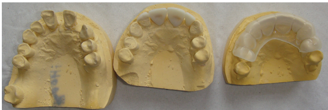
Figure 1.3 Diagnostic wax-up of the upper anterior teeth and fabrication of a clear stent to facilitate construction of provisional restorations.

of the root-treated teeth are demonstrated in Figures 1.4 and 1.5 respectively.