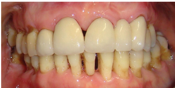
Figure 1.4 Postoperative clinical photograph.

Surgical periodontal treatment in the lower left sextant resulted in the elimination of the isolated residual deep periodontal pockets associated with LL6 which had grade III furcation involvement, and a tunnel preparation technique facilitated access for cleaning of the furcation area using an interdental brush. Management of teeth with furcation involvement is discussed in detail in Chapter 6.