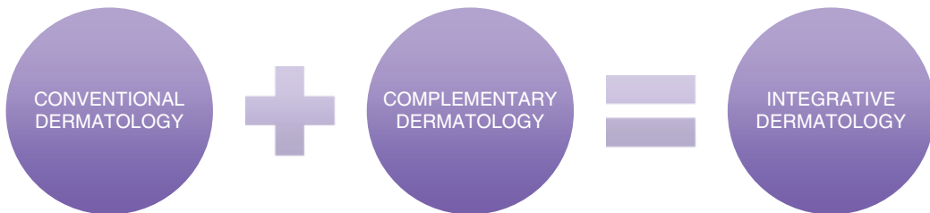
Figure 1.1 Integrative dermatology: combination of conventional dermatology and complementary dermatology.

The physician should ask the reason for the visit. The interview should address the duration and location of the patient's cutaneous diseases (if any), other diseases, family medical history, use of and allergy to medications, sun exposure, current and previous skincare regimens, daily habits including exercise and diet, and the patient's emotional state [11]. More questions should be asked during the physical examination as needed.