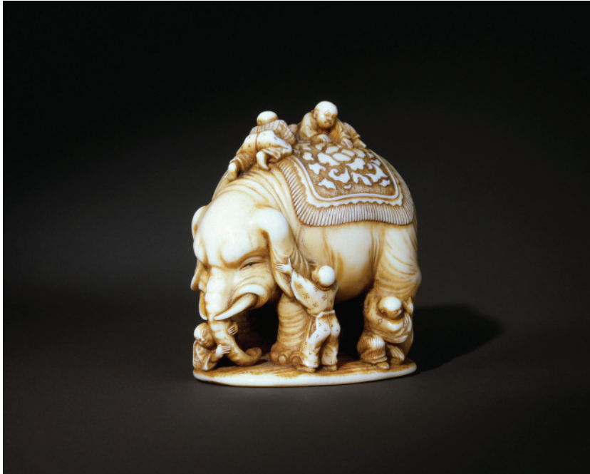
Figure 1.6 Blind Men and the Elephant , Meiji period (1868–1912), 19th century, Japan, Ivory, H. 1 5/8 in. (4.1 cm); W. 1 3/4 in. (4.4 cm).

ascetics.” 49 Such truths are not at all relative. Nor are they perspectival. In the Jain understanding, they are fully true.