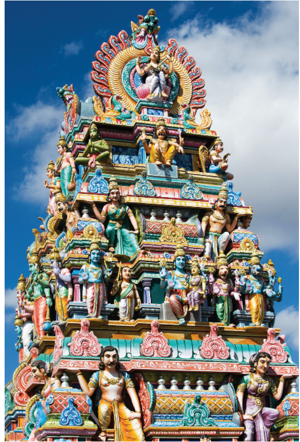
Figure 1.5 Hindu temple in Gopuram, India.

The Foreigner Consider the traditional abhorrence of the mleccha (the barbaric "foreigner"), the classical prohibition against "crossing the black waters" (that is, of leaving the subcontinent of South Asia), and,