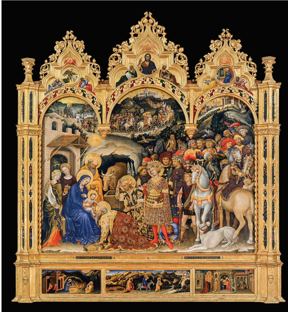
Figure 1.3 Adoration of the Magi (1423), by Gentile da Fabriano. Galleria dei Uffizi, Florence, Italy.