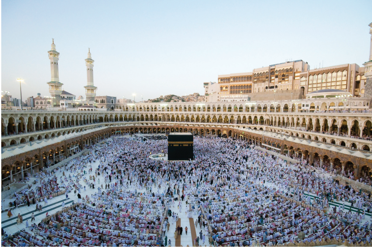
Figure 1.4 The Masjid al-Haram or “Sacred Mosque” surrounding the Kaba in Mecca, Saudi Arabia.

Judaism, and Zoroastrianism (the “people of the Book” again), in return for peace and protection: