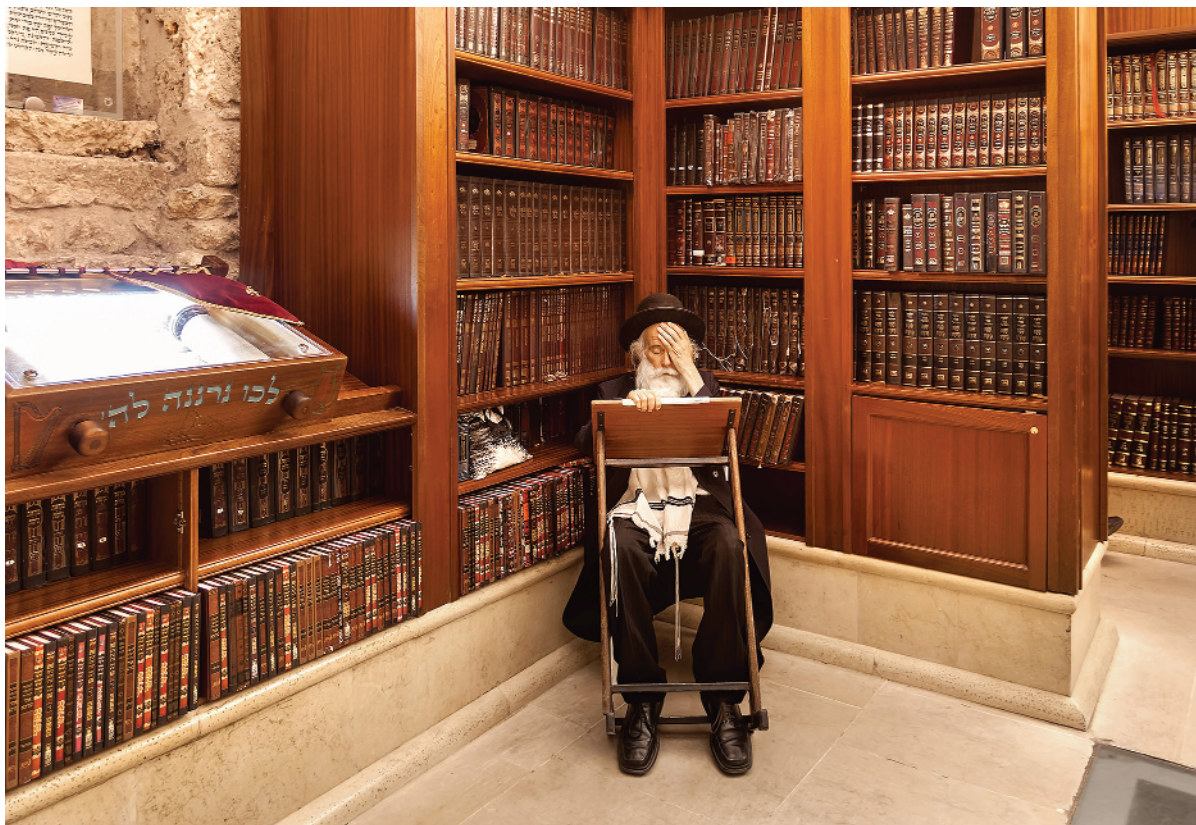
Figure 1.2 Rabbi learns Torah in Cave Synagogue, Jerusalem.

In short, there was not then, and is not now, one Judaism. There are many Judaisms.