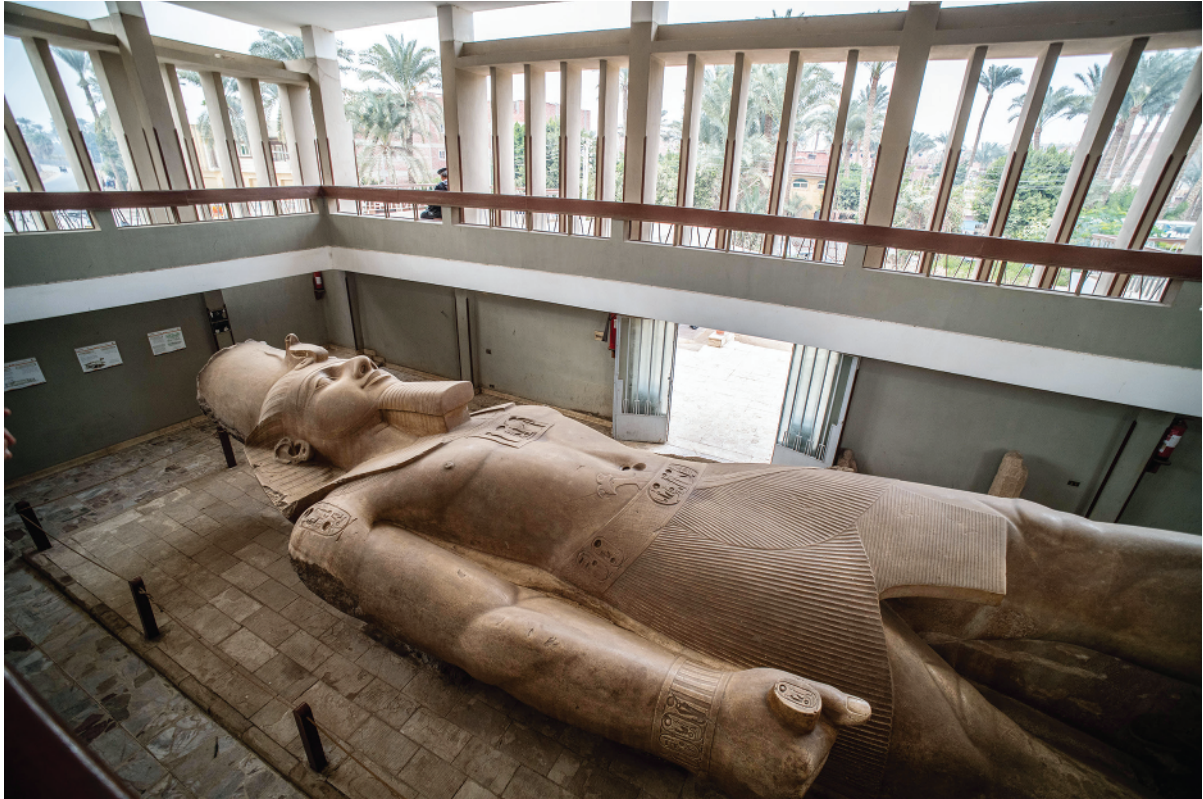
Figure 1.1 Giant stone statue portraying the Egyptian pharaoh Ramses II (c. thirteenth century BCE) as Osiris (the god of the afterlife). Abu Simbel temple, Egypt.

This idea of gods as exaggerated human beings is still very much with us in numerous forms and is called, after its apparent creator, Euhemerism . More superhumans.