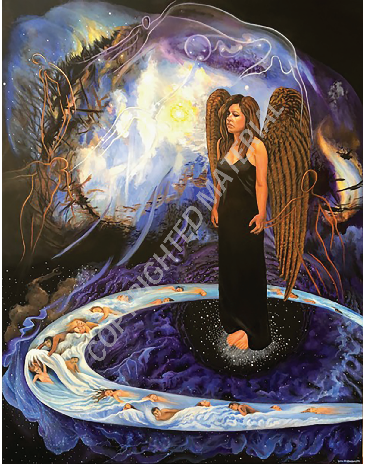
Mourning Angel (2020), by Lynn Randolph, 58" × 46"