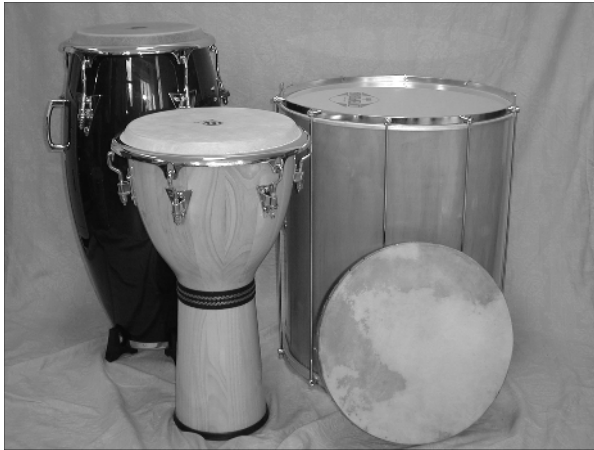
FIGURE 1-4: Traditional drums that you're likely to see today.