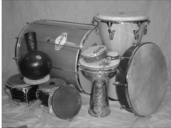
FIGURE 1-1: Drums come in all shapes and sizes.

The look of drum hardware can vary in a lot of ways. The hardware can be as simple as tacks nailed through the head into the shell, or it can be as elaborate as gold-plated cast metal rims with bolts that are tightened to precise torque tolerances (try saying that ten times fast). Either way, they all do the same thing: They create tension on the head so that it can vibrate freely against the edge of the shell. Check out Figure 1-2 for a few hardware styles.