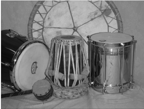
FIGURE 1-2: A variety of hardware styles.