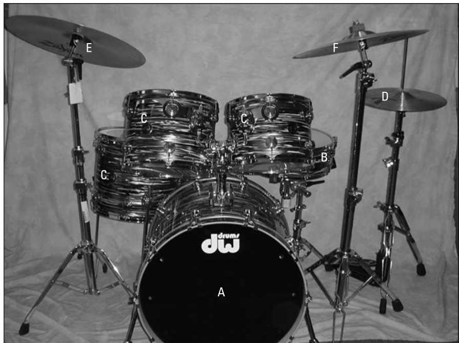
FIGURE 1-3: The modern drumset.