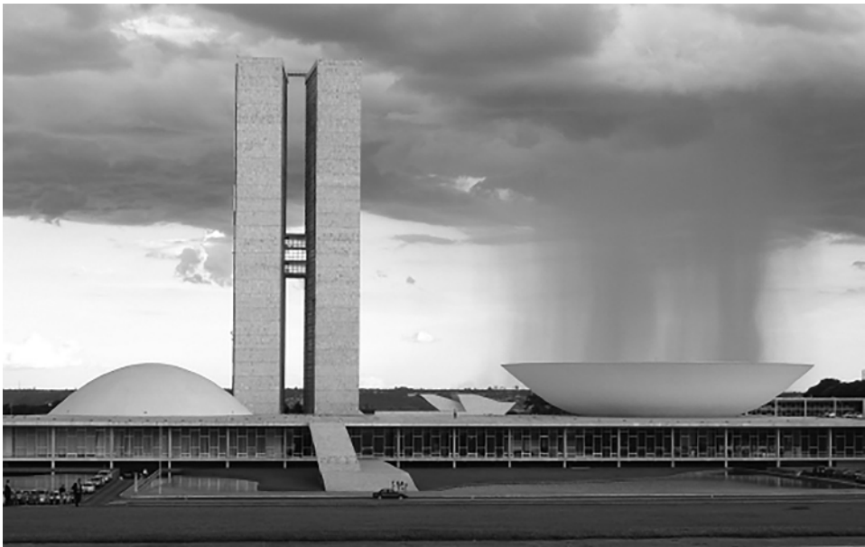
Figure 1.2 Brazilian National Congress being washed by rain. Architecture by Oscar Niemeyer.

Two major schools of painting that distinguish Latin American artists in the mind of the world today are the rich, colorful Haitian paintings that depict the complexity of