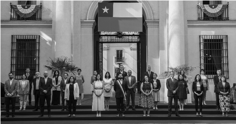
Figure 1.1 Official photograph of Chile's president Gabriel Boric and his cabinet of 10 men and 14 women in front of the Casa Moneda, Santiago, Chile, March, 2022.