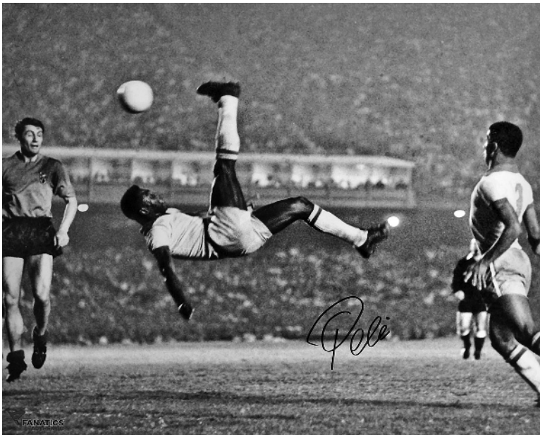
Figure 1.4 Pelé and the “bicycle kick” in a 1968 match between Brazil and Belgium. Other players have repeated the move, but it was made famous as Pelé’s signature play.

Despite Latin American nations having fielded many teams in the Olympics, the games only returned to the continent in 2016 and the Olympic Torch only passed through South America for the first time in 2004 on its way to the games in Greece. On June 13, 2004, one of the world's foremost athletes, Edson Arantes do Nascimento, known to the world as Pelé (Figure 1.4), ran through the streets of Rio de Janeiro with the torch before passing it on. Pelé, one of the most skilled players in the history of soccer, is credited with bringing Brazil to the forefront of world competition. In July 2008, at the age of 67, Pelé opened the game in Cape Town, South Africa, at a world soccer match commemorating former president Nelson Mandela on his 90th birthday. While celebrating the 2014 Brazilian games, the soccer icon nonetheless criticized the government for spending too much, saying at a press conference in May 2014 that the games were diverting too much money from schools and hospitals. Since Brazil's team for the 2022 World Cup is considered one of its best, it remains to be seen if victory on the playing field will erase the acrimony of the Rio games (Figure 1.5).