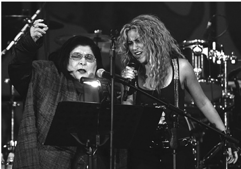
Figure 1.3 Colombian singer Shakira, right, and Argentine folk legend Mercedes Sosa at "The Concert for the Children" in Buenos Aires, May 17, 2008. The concert is one of many sponsored by Shakira's ALAS foundation ( América Latina en Acción Solidaria), which raises money to improve the lives of impoverished children in Latin America.

Today's music scene has witnessed a blending of styles from Latin America, the United States, and Europe (Figure 1.3). The borders that previously separated the Americas are now porous for both people and music; Latin American rhythms regularly float from mainstream US and European radio. Carried with the migrant culture, Latin pop has introduced new forms of hip-hop that bear the stamp of plena and bomba styles from Latin America, and incorporate the strong social critique often expressed in US rap music along with, regrettably, a fair share of misogynist and violent lyrics. The rhythm of Latin music accompanies the migration of people from Latin America into major urban areas and even into the more sparsely settled Midwestern heartland. Latin music has become mainstream in the United States and in much of the world with the appearance (sometimes