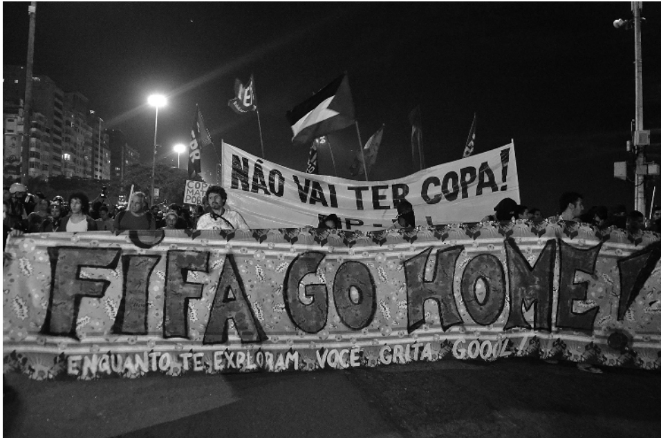
Figure 1.5 Over a million people throughout Brazil demonstrated against the 2014 World Cup in the months before and during the international games. Signs called for FIFA (the world soccer federation) to “go home” and condemned the waste of money and resources on the game while Brazil needed schools, hospitals, and better infrastructure.