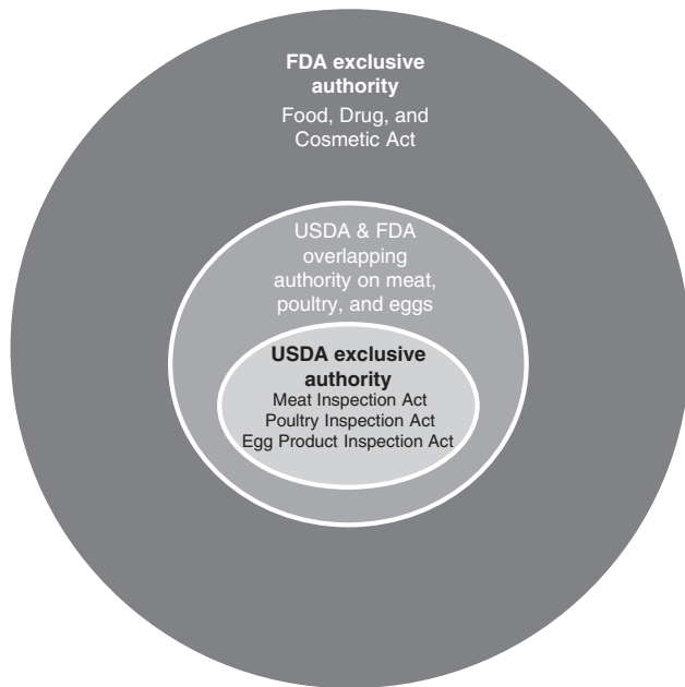
FIGURE 1.2 Overlapping statutory authority.

Federal Meat Inspection Act (FMIA) The FMIA of 1906 was substantially amended by the Wholesome Meat Act of 1967. 52 The FMIA requires USDA to inspect all cattle, sheep, swine, goats, and horses when slaughtered and processed into products for human consumption. The primary goals of the law are to prevent adulterated or misbranded livestock and products from being sold as food, and to ensure that meat and meat products are slaughtered and processed under sanitary conditions.