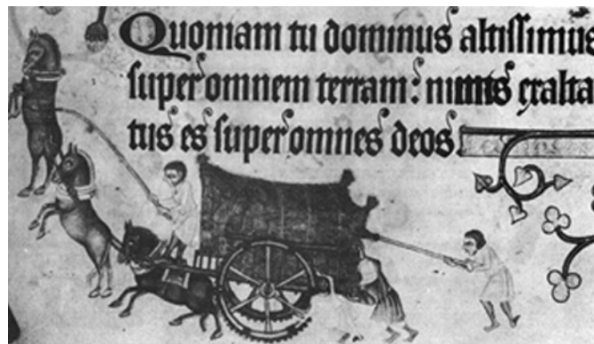
Figure 1.1.1 Drawing of two-wheeled harvest cart with studded wheels. Luttrell Psalter (folio 173v), circa 1338 AD.

Egyptians, circa 1880 BC (Layard, 1853). In this transportation, 172 slaves are being used to drag a large statue weighing about 600 kN along a wooden track. One man, standing on the sledge supporting the statue, is seen pouring a liquid (most likely water) into the path of motion; perhaps he was one of the earliest lubrication engineers. Dowson (1998) has estimated that each man exerted a pull of about 800 N. On this basis, the total effort, which must at least equal the friction force, becomes 172 \times 800 N. Thus, the coefficient of friction is about 0.23. A tomb in Egypt that was dated as from several thousand years BC provides the evidence of use of lubricants. A chariot in this tomb still contained some of the original animal-fat lubricant in its wheel bearings.