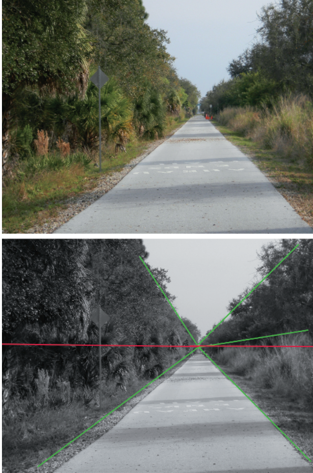
Figure 1.2 Elementary characteristics of perspective and the optic array. The optic array preserves information about the observer's eye height and relative position within the scene: All lines parallel to the ground plane project toward the horizon line, which designates the observer's eye height (marked by the red horizontal line in the lower photo). (More generally, all lines parallel to any plane project to a common great circle in the optic sphere.) All lines parallel to any given direction (e.g., marked by the green lines in the lower photo) converge toward a common point. The green lines in this photo are approximately parallel with the camera's viewing direction, but their locus of convergence is independent of the observer's viewing direction. The horizon line and convergence points of parallel lines are independent of the focal length of the lens and the resolution of the image recording system, as well as the particular objects in the scene.