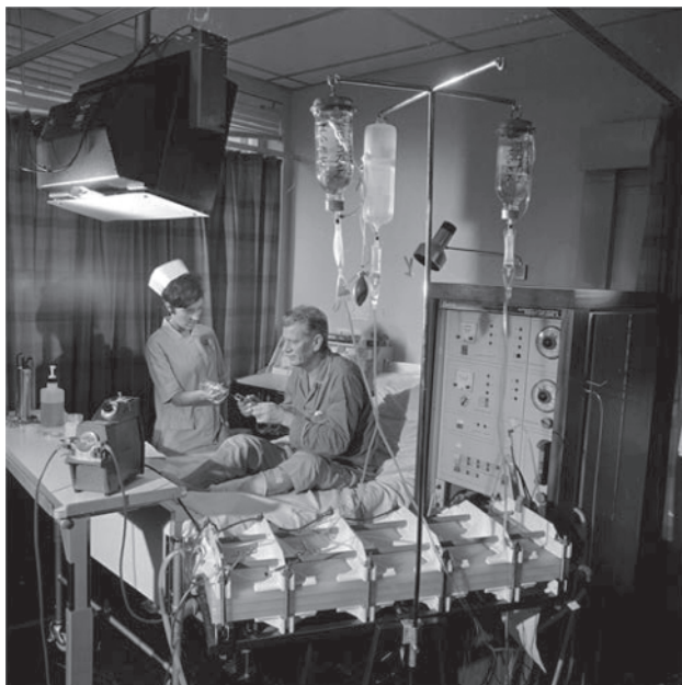
FIGURE 1.2 Patient and nurse with dialysis machine and Kiil dialyser, 1968.

considered for home treatment, often with surprisingly good results, as the dialysis could be moulded to the requirements of the individual, rather than the patients conforming to a set pattern. However, with the development in the late 1970s and early 1980s of CAPD as the first choice for home treatment, the use of home HD steadily dwindled. It is now, however, seeing renewed interest. The National Institute for Clinical Excellence (NICE) published guidance on home versus hospital HD (NICE 2002) and recommended all suitable patients should be offered the choice between home HD or HD in a hospital/satellite unit. Sadly this has not led to wide-scale uptake of home HD, with only 1,396 adult patients were receiving HHD for ESKD in the UK in 2021, which represents 2.0% of the whole population who require replacement therapy for ESKD (UK Renal Registry 2023).