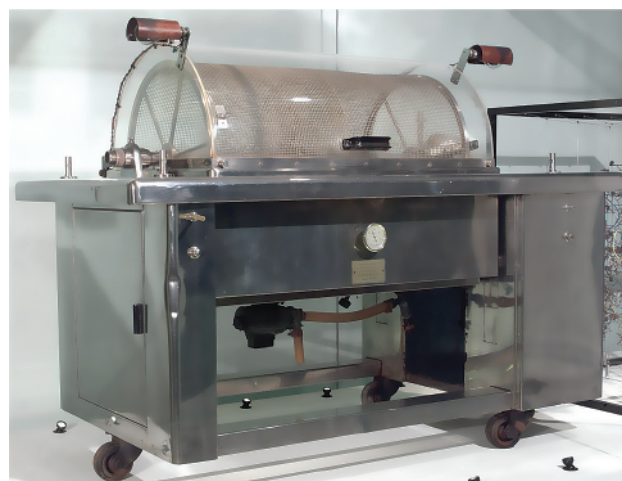
FIGURE 1.1 Artificial kidney machine (Kolff–Brigham), France, 1955.