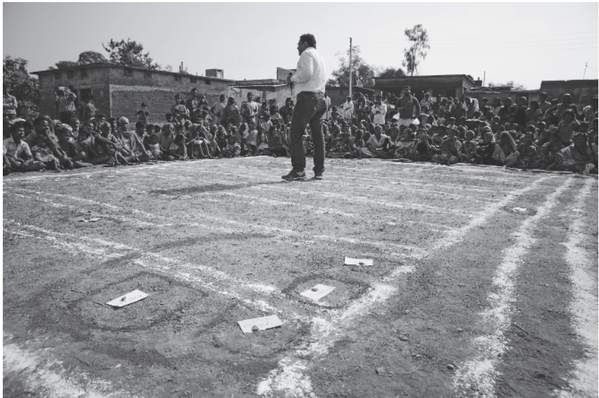
Figure 1.1 Community in Bihar, India, 2016 implementing CLTS.

This is how CLTS works: In the middle of the community, local leaders and residents gather around a central meeting point as volunteers draw a chalk map of the village on the ground. A local community health worker brings a bag of sawdust and invites community members to sprinkle it on the map to indicate where they defecate. Soon, parts of the map are covered with piles of sawdust, with a few piles placed inside the village. They see how much human waste has piled up in the village. The health worker then explains how flies transfer germs from human feces to nearby food, making the communities realize they've been effectively consuming each other's waste, resulting in widespread illness and increased health costs. This realization generates pressure on their leaders to act, advocate for funds from the central government to build latrines, and implement policies banning the practice of open defecation.