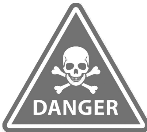
Figure 1.3 A commonly used “DANGER” sign.

A hazard is any item, circumstance, or behavior that can cause injury, sickness, environmental harm, or property damage. Some are readily recognized and rectified, whereas others are unescapable aspects of the work that must be minimized and managed via various control measures.