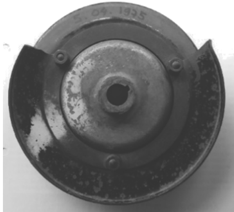
Figure 1.1 Failed water pump pulley.