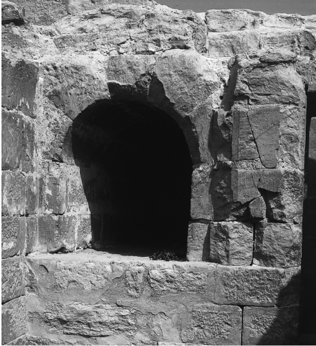
Plate 4 South Temple at Karanis, chamber for crocodile mummy.

And they remit to the overseers of the temples and the chief priests and priests the arrears on account of both the tax for overseers and the values of woven cloths up to the 50th year.