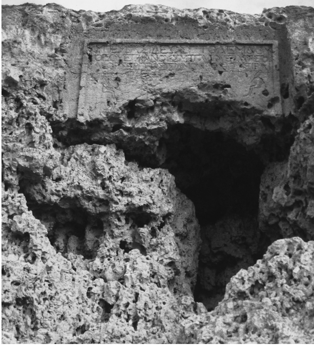
Plate 3 Inscription of Hakoris son of Herieus at Tenis; his son Euphron figures in the papyrus.

erary Greek reminiscent of Polybius and in an elegant hand, is only fragmentarily preserved, but it seems to concern mainly an episode in which the forces of Philometor tried to capture a fort belonging to Euergetes, only to get trapped inside and suffer a severe defeat. It is apparently Euergetes' general who writes to his king.