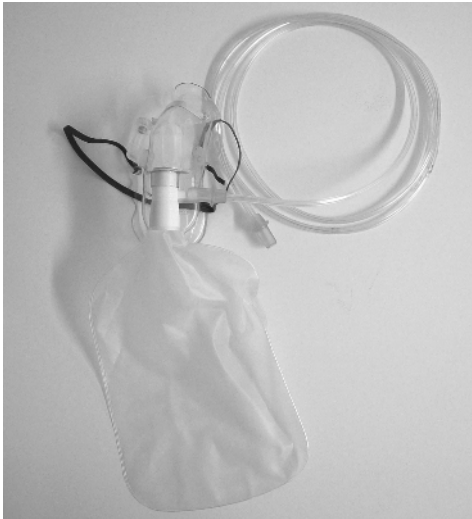
Figure 1.4 A non-rebreathe mask. Taken from Jevon, P (2007) Treating the Critically Ill Patient . Blackwell Publishing, Oxford, with permission

Attach appropriate monitoring devices, for example pulse oximetry, ECG monitor and non-invasive blood-pressure