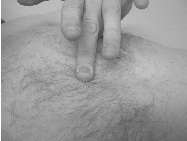
Figure 1.6 Measuring the central capillary refill time (CRT).

prolonged CRT could indicate poor peripheral perfusion, although other causes can include cool ambient temperature, poor lighting and old age (Resuscitation Council UK, 2006).