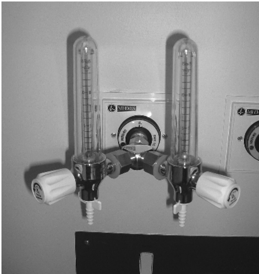
Figure 1.1 A wall mounted oxygen cylinder, fitted with a variable oxygen-flow-rate meter capable of delivering up to 15 litres/min

Facilities should be available for the delivery of high concentrations of oxygen: either piped oxygen to a wall-outlet behind the patient's bed (preferable), or a portable oxygen cylinder, fitted with a variable oxygen-flow-rate meter capable of delivering up to 15 litres/min (Figure 1.1). There should also be adequate stocks of various oxygen-delivery devices, particularly non-rebreathe masks (see Figure 1.4, below).