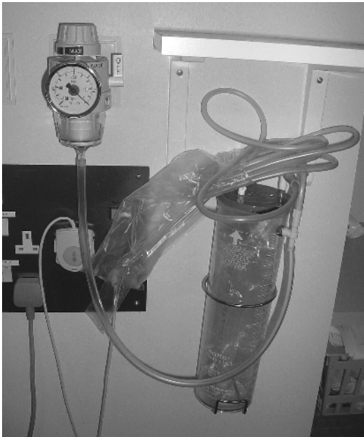
Figure 1.2 A wall-mounted suction device

At the very least, an ECG monitor and a pulse oximeter should be available. Other monitoring facilities, for example capnography, may also be required in some clinical areas.