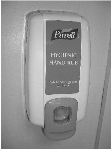
Figure 1.3 Hygienic hand-rub

risk of cross-infection. Wash hands or use alcohol gel following local policy (Figure 1.3).