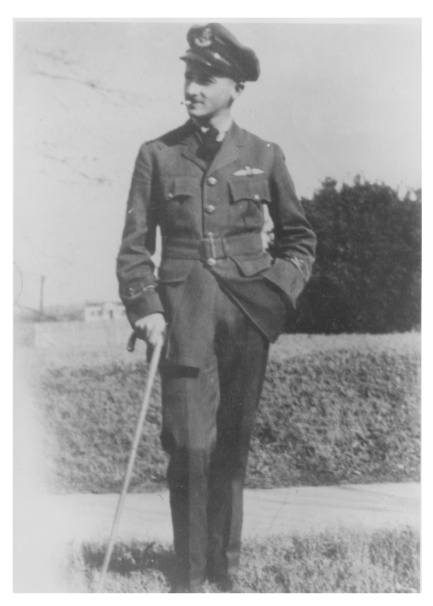
FIGURE 1 Faulkner posing in the Royal Air Force uniform he purchased before returning to Oxford, Mississippi, after flight training in Toronto (July 1918). Cofield Collection, Southern Media Archive, University of Mississippi Special Collections (B1F38).