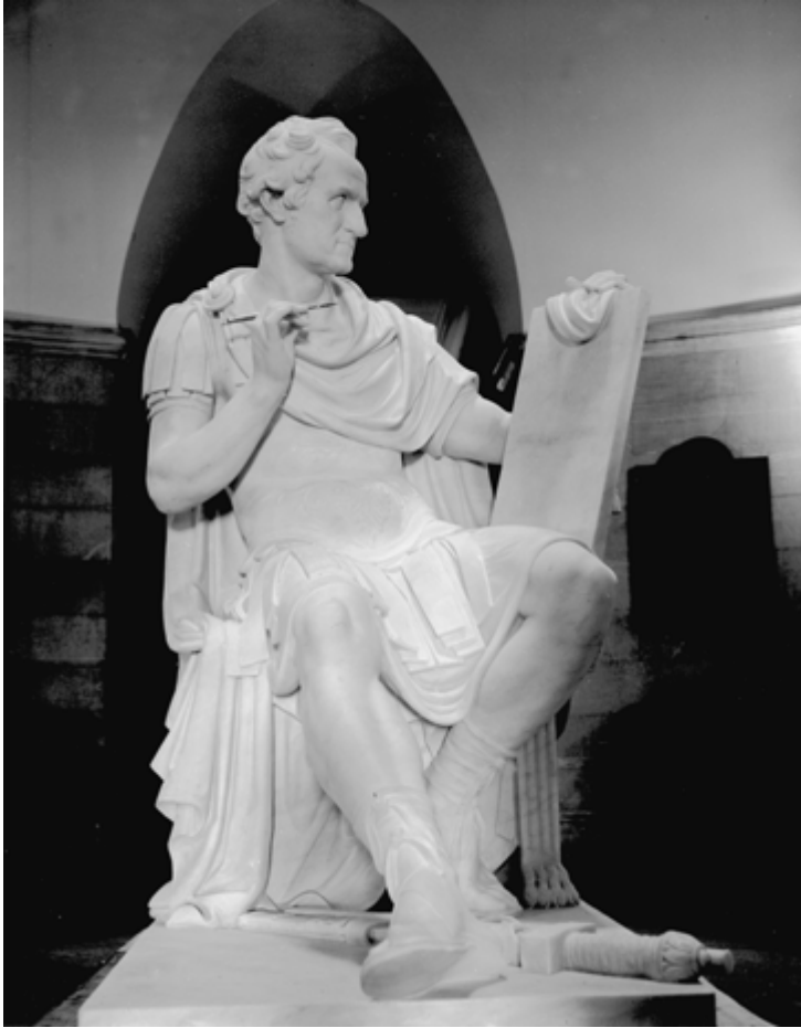
Figure 1.1 Antonio Canova, General George Washington , 1820–1.

clearly admired Julius Caesar, and admired his imperial successor, Caesar Augustus, even more. French artists active at the court in Paris utilized references to both Roman rulers in art and iconography to illustrate and celebrate Napoleon's move from victorious general and first consul of the French Republic to Napoleon I, emperor of France. 44 By 1802 it had become clear that Napoleon intended to eliminate the newly created French Republic: he named himself first consul for life and in 1804, with the pope presiding, he crowned himself emperor (figure 1.2). As emperor, his face and name adorned coins, engravings, paintings and public monuments, a campaign of propaganda modeled on that of Augustus, the Roman emperor who claimed to have brought peace to the strife-torn republic and to have launched a golden age of prosperity and culture.