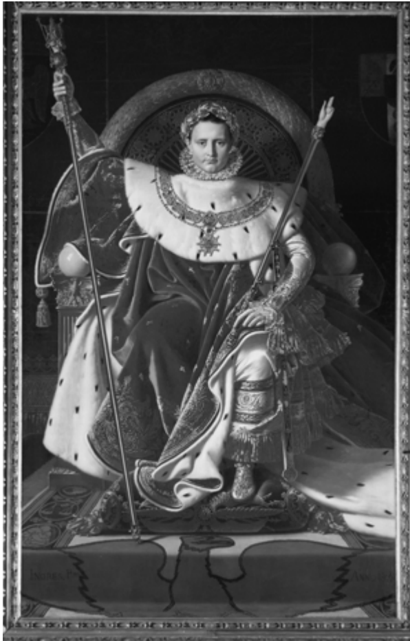
Figure 1.2 Jean Auguste Dominique Ingres, Napoleon on His Imperial Throne , 1806. Oil on canvas. Musée des Beaux-Arts, Rennes, France.

For American observers, the failure of the French Republican experiment and its descent into absolutism in the person of Napoleon was disturbing but not surprising. The trajectory of the French Revolution and its aftermath was consistent with the classic cycle of imperial rise and fall in which republican democracy leads to mob rule, then autocracy and tyranny. It was the different outcome of the American Revolution that was the real surprise. 45