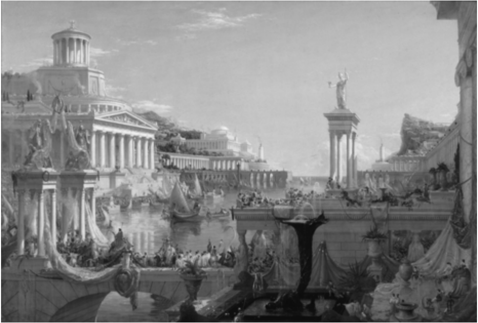
Figure 1.5 Thomas Cole, The Course of Empire: Consummation (third of the series), 1835–6. Accession number 1858.3.

Cole chose a phrase from Bishop George Berkeley's poem Destiny of America – the idea of an unvarying cycle of imperial rise and decline: