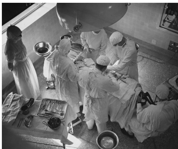
Fig. 1.2 Operating theatre in the 1960s.