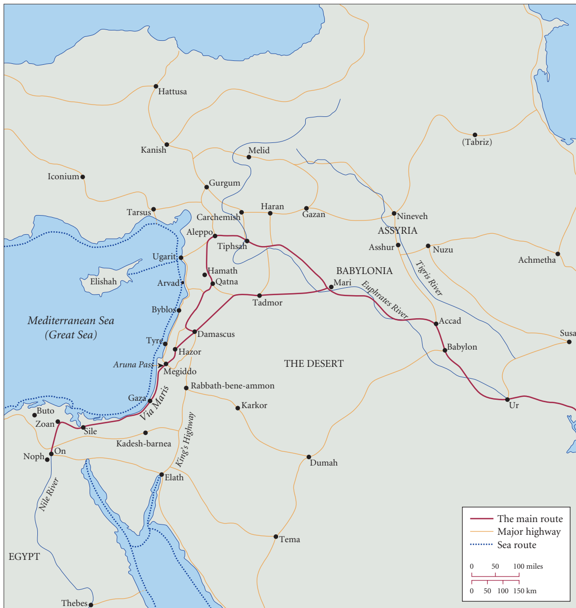
Map 1.2 The major routes of the ancient Near East. Note how the major routes move from Egypt on the left through Judah/Israel near the Mediterranean to Syria and Mesopotamia to the northeast and east. Redrawn from Yohanan Aharoni and Michael Avi-Yonah (eds.), The Macmillan Bible Atlas (revised edition). New York, Macmillan, 1977, map 9.