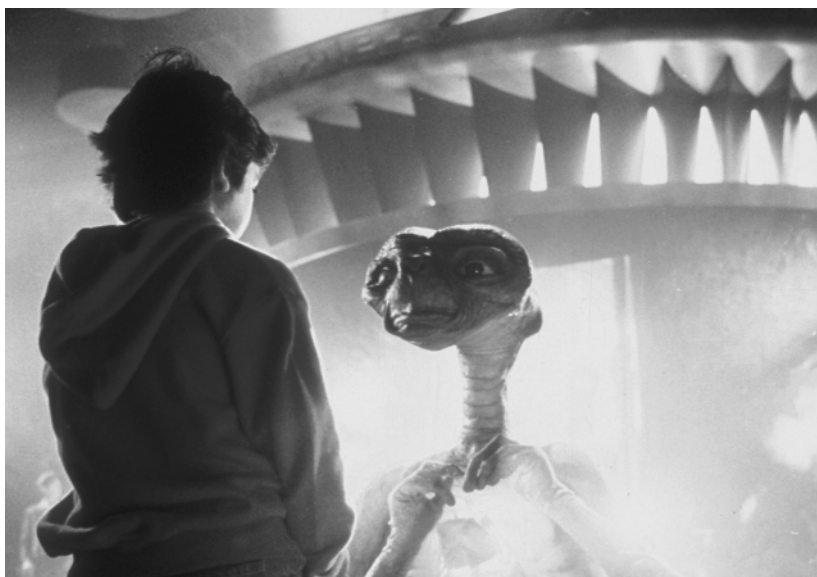
PLATE 1 E.T.: The Extra-terrestrial (1982 Universal): Science fiction or fantasy?

a futuristic outer-space setting, Alien (1979) is arguably both horror and sci-fi. And with its space alien, E.T.: The Extra-terrestrial (1982) is certainly science fiction, but shades into fantasy in its homage to other classics in the genre such as The Wizard of Oz (see Ch. 4) and Peter Pan – a story explicitly referenced in the film and also echoed through a delight in spontaneous flight (the famous bicycle scene) and through an emphasis on belief when encountering fantastic phenomena (Plate 1).