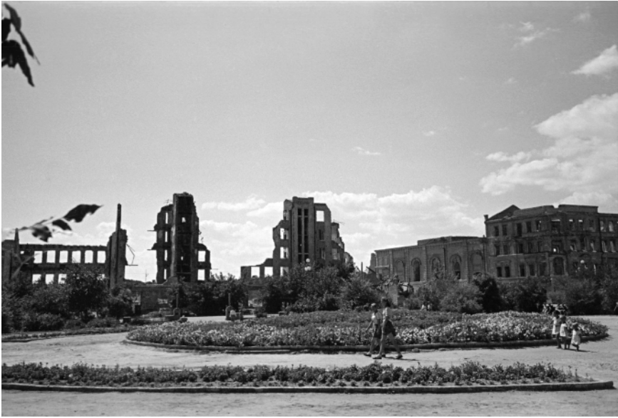
FIGURE 1.1 Stalingrad, summer 1945.