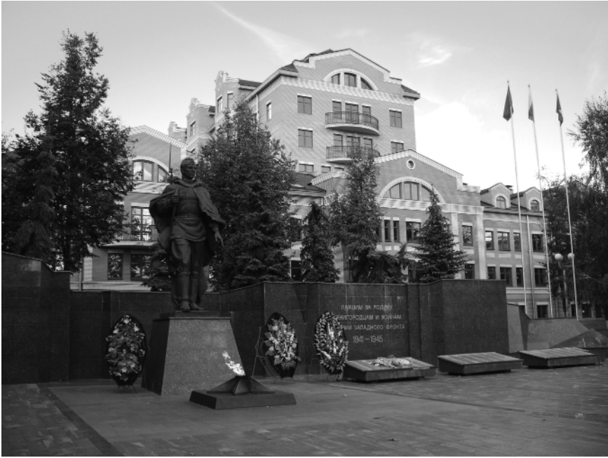
FIGURE 1.4 War memorial, Zvenigorod, west of Moscow, August 2007. The memory of the war is manifestly alive in this small town, which saw terrible bloodshed in 1941. In September 2009, the local authorities announced the imminent construction of an improved granite memorial engraved with the names of the 149 local inhabitants who died in the fighting.