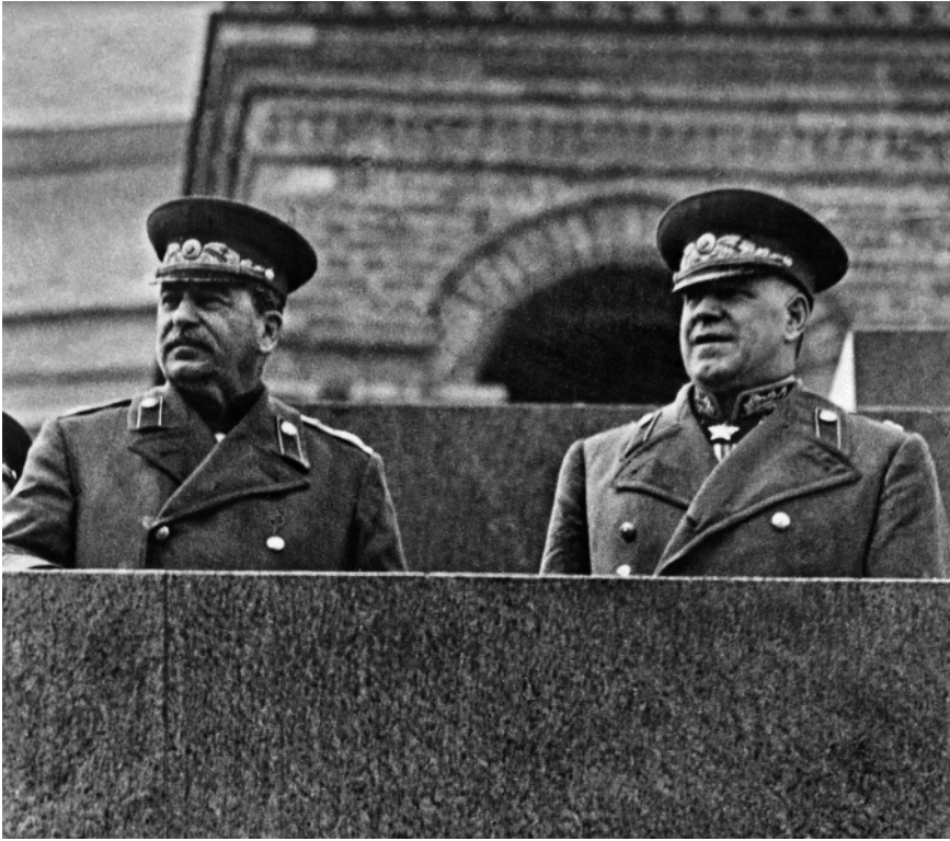
FIGURE 1.2 Stalin and Zhukov on the Lenin Mausoleum, 1945. The Party and the military in uneasy equilibrium.