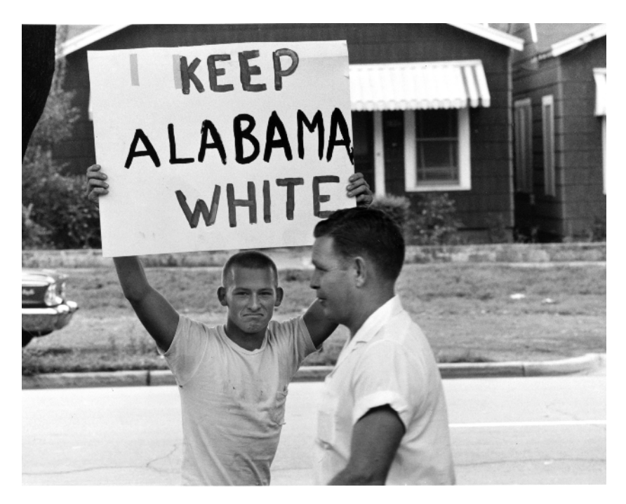
Photo 4. A protester against integration in Birmingham, Alabama; 1963.