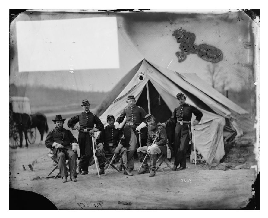
Photo 1. Six officers of the 17th New York Battery, Gettysburg, June 1863 Library of Congress, Washington, DC.

wounded and the dead – the aftermath of battle. These photographs, although subdued by today's standards of graphic images, "had a profound effect on viewers used to artistic depictions of wartime heroics. . . . The absence of uplifting tone in camera documentations was especially shocking because the images were unhesitatingly accepted as real and truthful" (Rosenblum, 1984, p. 182).