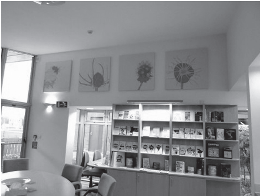
Fig. 1.5 Examples of written information on offer in a cancer information centre. (Reproduced with permission of Macmillan Cancer support.)