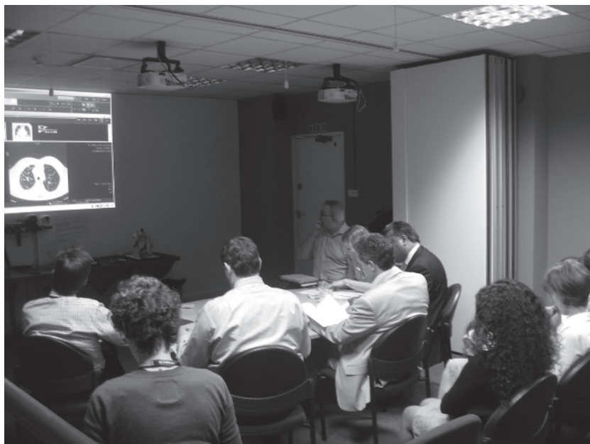
Fig. 1.3 A multidisciplinary team meeting.