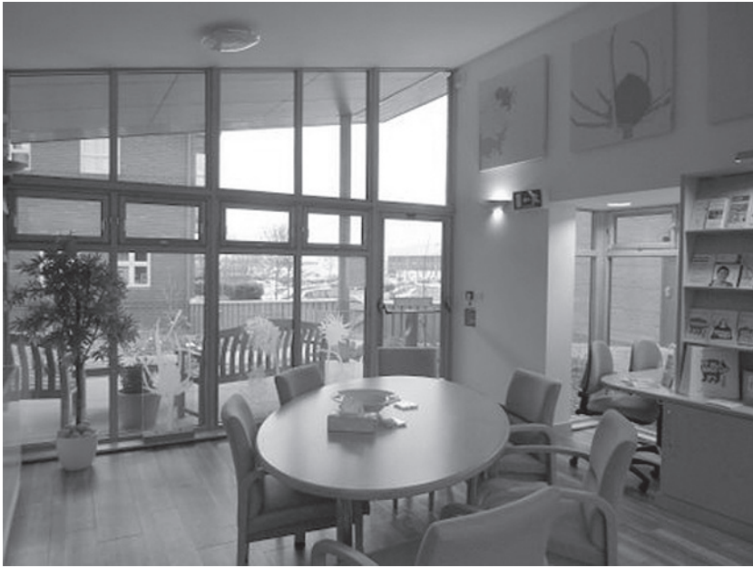
Fig. 1.4 A Macmillan Cancer Information Centre.