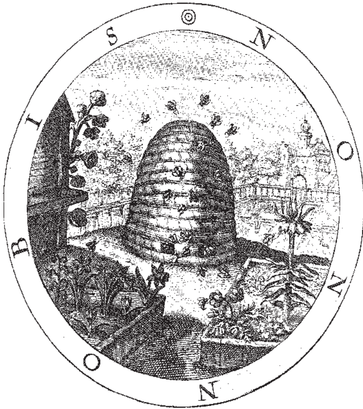
Engraving illustrating a sixteenth-century work on apiculture: the words Non nobis indicate that the bees themselves do not profit from the honey they make.

bring a single litre of nectar back to the hive, and five litres of nectar make one litre of honey.