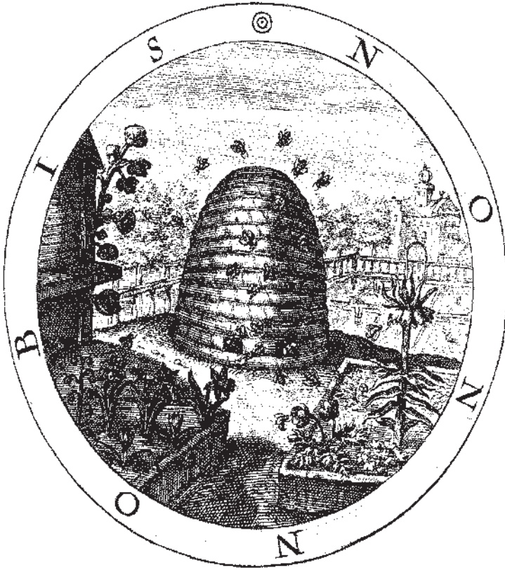
Engraving illustrating a sixteenth-century work on apiculture: the words Non nobis indicate that the bees themselves do not profit from the honey they make.

bring a single litre of nectar back to the hive, and five litres of nectar make one litre of honey.