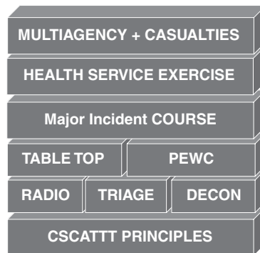
Figure 1.1 The structured approach to major incident exercises. PEWC, practical exercise without casualties.

Knowledge and understanding can be built through lectures or an online training programme; practical skills (such as triage or the use of a radio) can be acquired individually; decision-making and judgement can be assessed through a tabletop exercise. This step-wise approach to learning allows staff to have built their competencies in a controlled environment and to participate with confidence in a multi-agency exercise with simulated casualties (when there is little or no opportunity to interrupt the flow of activity for structured education). Staff will also be empowered to give more informed feedback on how the plan worked.