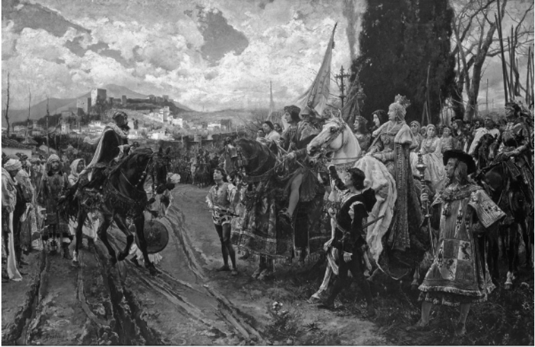
Figure 1.1 Painting (Detail) from 1882: Boabdil confronted by Ferdinand and Isabel after the Fall of Granada, 1492. The capture of Granada in 1492 completed the Reconquest of Spain for Christendom. Here King Ferdinand of Aragón and his wife, Queen Isabel of Castile, receive the surrender of Muhammad XII, Abu ‘abd-Allah Muhammad XII (1460–1533), known as Boabdil (a Spanish corruption of the name Abu Abdullah ).

peninsula to the islands off the Chinese coast—was impossible given the distance and time that would have to be spent at sea. It could not be done. And the commission was right on both counts. What neither the commission nor Columbus accounted for was the existence of the American continents about 3000 miles to the west, blocking the passage to the East.