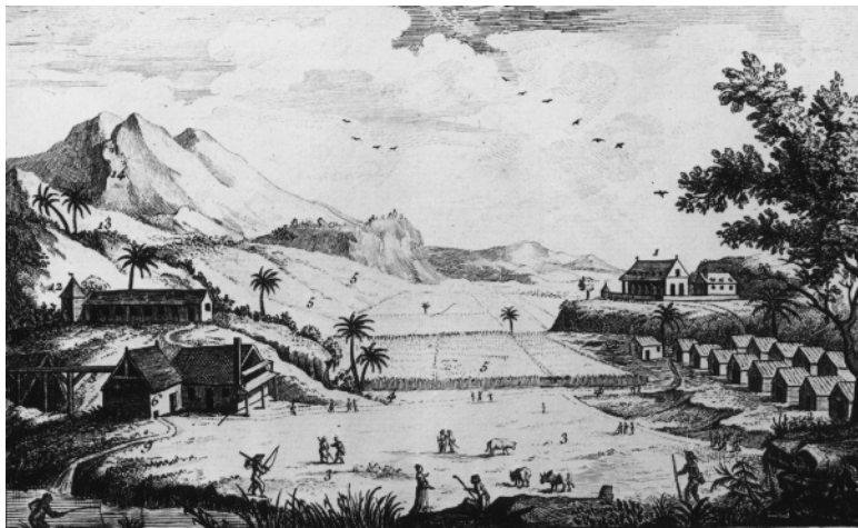
Figure 1.1 Plantations and slave labor. Illustrations to the French Encyclopédie ( Encyclopedia ) of the mid-eighteenth century treated black slavery as a normal aspect of economic life, although other articles in this compendium of Enlightenment thought raised some questions about the institution. The upper illustration here shows blacks harvesting cotton and preparing it for shipment to Europe. Slave huts are clearly visible on the right in the depiction of a sugar plantation (below), even though slaves themselves are not shown in the picture. Source: Copper engraving from D. Diderot, Encyclopédie ou dictionnaire des sciences . Photo: Paris, Bibliothèque Nationale / AKG-images.