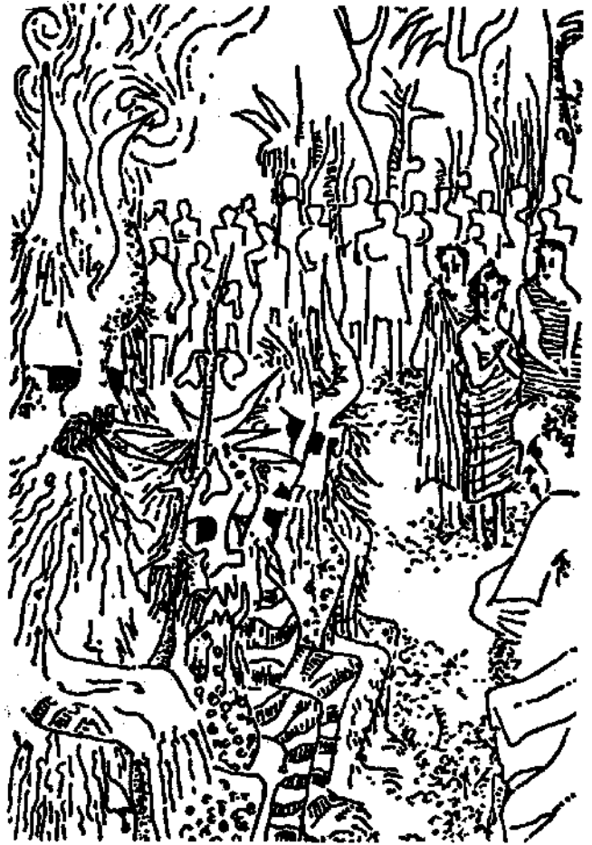
Figure 1.3 Uche Okeke, Illustration of Things Fall Apart , 1960–2, pen and ink on white paper, © Uche Okeke.