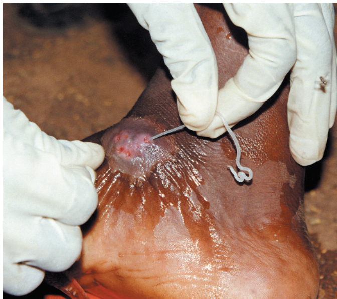
Figure 1.2 Disfiguring effects of the NTDs. (Top) Elephantiasis of the leg due to filariasis, Luzon, the Philippines. (Bottom) Guinea worm infection, with female worm emerging from the patient's foot.