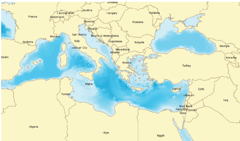
Figure 1.3. Semi-enclosed seas in the sense of article 122 of the UNCLOS. Document does not presuppose any support for the claims of governments