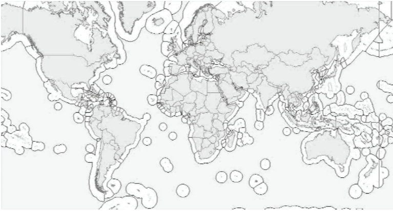
Figure 1.2. View of territorial waters and EEZ (white) forming waters under sovereignty and under jurisdiction, as opposed to zones outside jurisdiction (light gray) (source: www.vliz.be , adapted from Thema Map software, 2012, https://themamap.greyc.fr ). Document does not presuppose any support for the claims of governments, from [GAL 12]

A rarer situation is the one allowed by the new international Law of the Sea in which a state, or several states jointly, may request to extend its (or their) legal continental shelf to the outer edge of the continental margin (a geomorphological concept); that is up to 350 NM (= 648,200 km) measured from the baseline, or by 100 additional NM (= 185,200 km) calculated from the 2,500 m isobath linking all points situated at 2,500 m of depth. The system applied is still the one of sovereignty over the legal continental shelf. In the event of agreement granted by the Commission on the Limits of the Continental Shelf (CLCS) to several States following their joint request, all that remains for these States is to mark out among themselves the lateral portions of the shelf belonging to each of them.