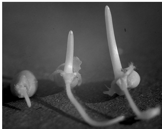
Figure 5.2 Germinating wheat kernel