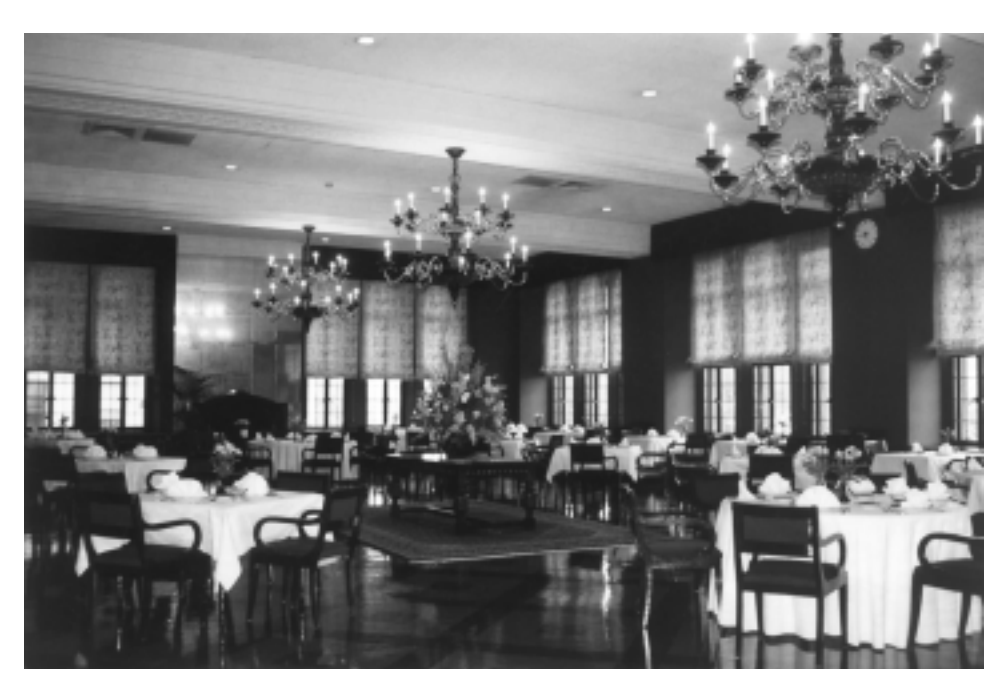
FIGURE 2-7 CLUB FACILITIES.