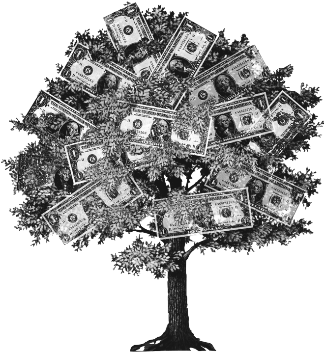
FIGURE 1.1 Your money tree.

As you can see, at bank rates of 3 percent it will take 468 years for a single dollar bill to grow into $1 million. What? Not planning on living 468 years? Relax. We're not done with that dollar bill yet. We've got to supercharge it. How can we do this? Rather than just planting one money seed, could you plant them more often? Could you afford to put away a dollar a day? Thirty bucks a month! You can do that.