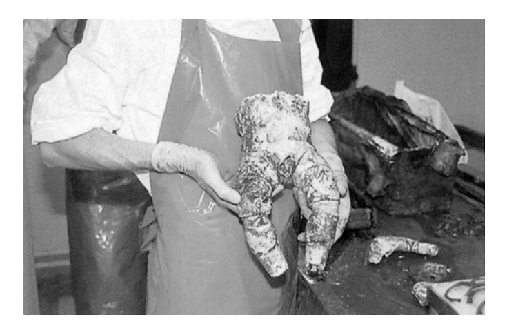
Figure 1.4 The formation of adipocere has preserved the body of this child despite it being buried for about 3 years. (Reproduced from Shepherd, 2003, with permission from Arnold)