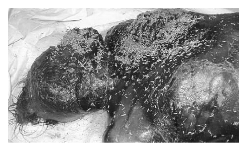
Figure 1.3 Blowfly maggots developing upon a human corpse. Note how mature maggots can be seen crawling over the surface and the discoloration of the skin. (Reproduced from Klotzbach et al. , 2004, with permission from Elsevier)

events. As the body enters the bloat stage, it can be said to be 'actively decaying' and during this time the soft body parts rapidly disappear as a result of autolysis and microbial, insect and other animal activity. The body then collapses in on itself as gases are no longer retained by the skin. At this point, the body is said to enter a stage of 'advanced decay' and, unless the body has been mummified, much of the skin will now be lost. Obese people tend to decay faster than those of average weight and this is said to be due to the 'greater amount of liquid in the tissues whose succulence favours the development and dissemination of bacteria' (Campobasso et al. , 2001). At first sight, this appears surprising because fat has a lower water content than other body tissues and obese individuals therefore have a lower than normal water content. However, fat can act as a 'waterproofing', preventing the evaporation of water and therefore the drying out of the corpse whilst its metabolism yields large amounts of water.