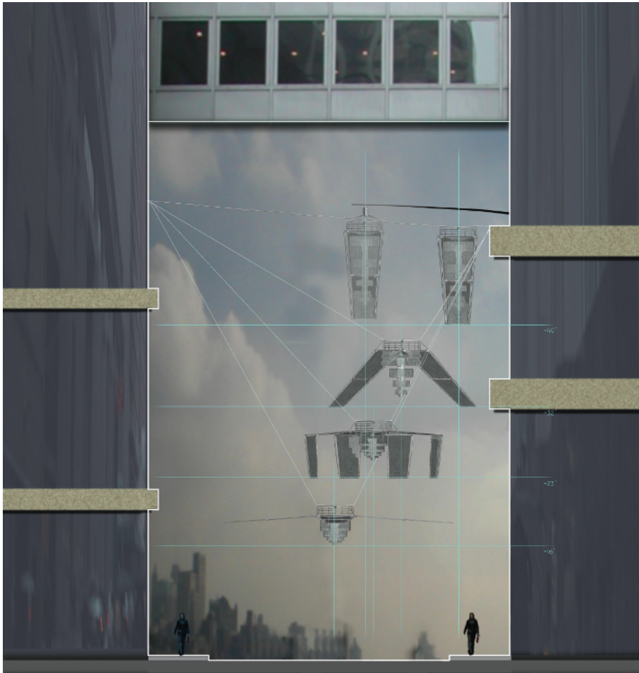
Figure 1.3. Illustrator and Photoshop, ambient space section-elevation.