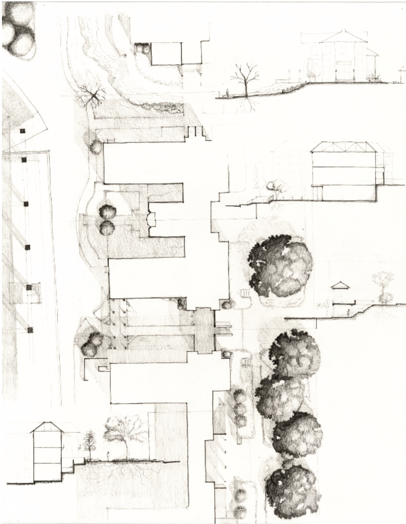
Figure 1.1. Graphite, walking plan.

The connections between analog and digital modes go beyond naming conventions into techniques and processes. Current digital rendering processes vary greatly between individuals and firms, as well as across a range of software. It is commonly said that there are an infinite variety of ways to accomplish the same task in image- or vector-editing software. The versatility of most software packages comes from the variety of tools and the options for combining those tools to complete a specific task. This versatility allows the software to be used across a variety of professions from photography to technical illustration. Because of the depth and versatility of the software, the learning curve is typically steep for new users. Similar to using a pencil and pen, there is no way to automatically generate a section, plan, or elevation. Instead, a combination