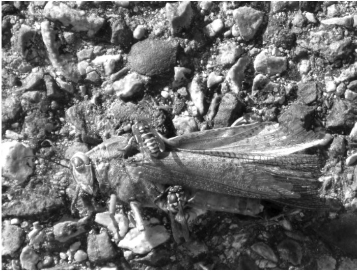
Figure 1.6 Omnivores such as wasps will consume both the body and any insects present