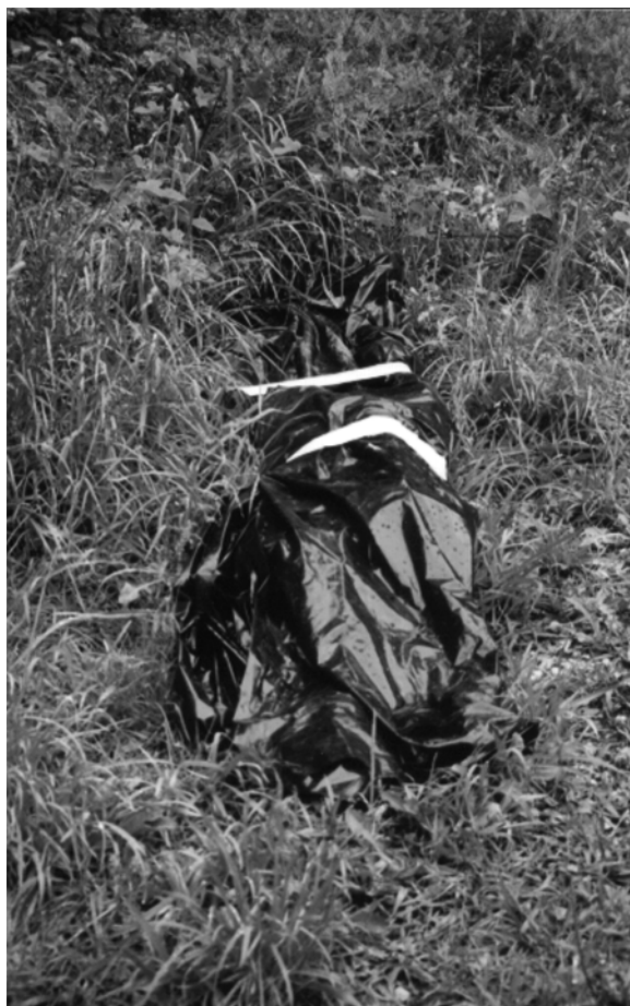
Figure 1.3 Body in wrappings

2002; Oliveira-Costa and de Mello-Patiu, 2004; Moretti, Bonato and Godoy, 2011). The majority of medico-legal cases where entomological evidence is used are the result of illegal activities that take place on land and are discovered within a short time of being committed. In France for example, 70% of cadavers are found outdoors and, of these, 60% are discovered within less than one month (Gaudry et al. , 2004).