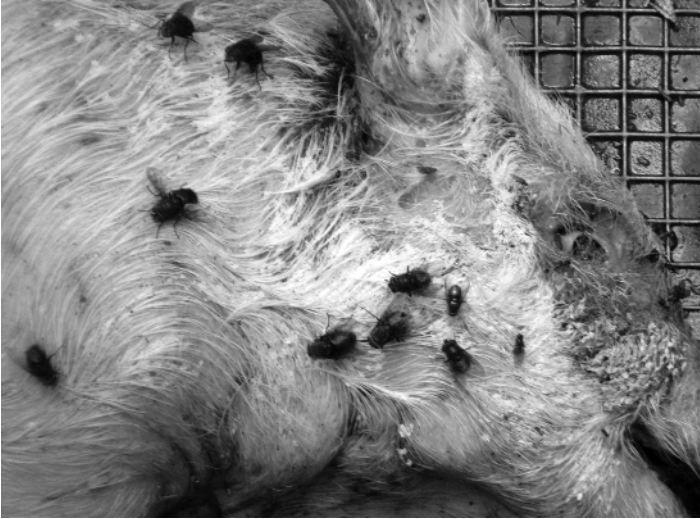
Figure 1.4 Necrophagous insects colonising a body

they feed on the necrophagous insects that are present. Forensically relevant insects can be grouped into four categories based on feeding relationship. These are: