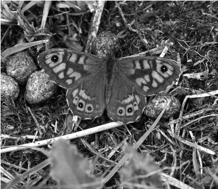
Figure 1.8 An opportunist butterfly attracted to faecal material.

chimney in 1848 and that the moths had gained access in 1849. As a result of this estimation of the time since death, occupiers of the house previous to 1848 were accused and the current occupiers exonerated (Bergeret, 1855).