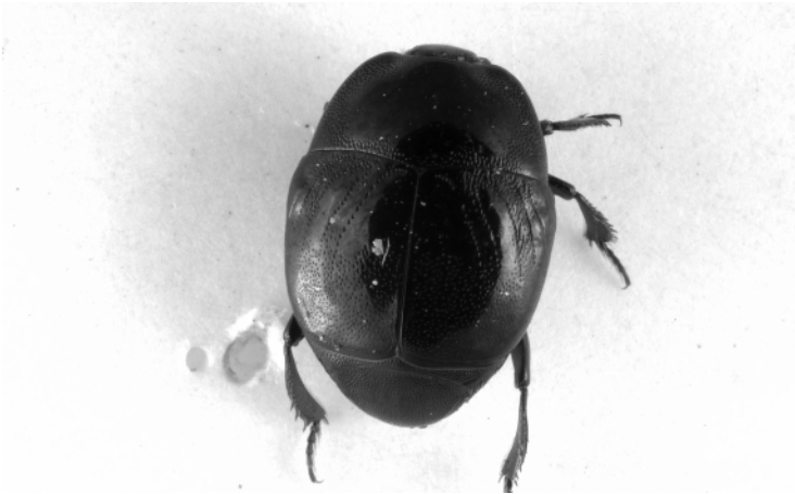
Figure 1.5 Predatory beetles will consume eggs and larvae of those flies colonising the body