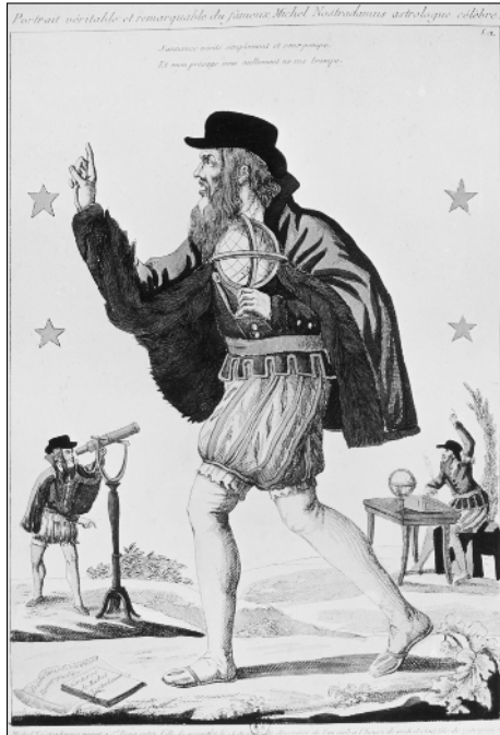
Figure 1-1: Walking a mile in Nostradamus's shoes.

Nostradamus, personally, and only rarely include an indication of his opinions. But more than writings make the man, and knowing some of the details of his life and times can help you understand just who this guy was and why he still fascinates many people today. (Start things off by checking out Figure 1-1 for a glimpse of what he looked like.)