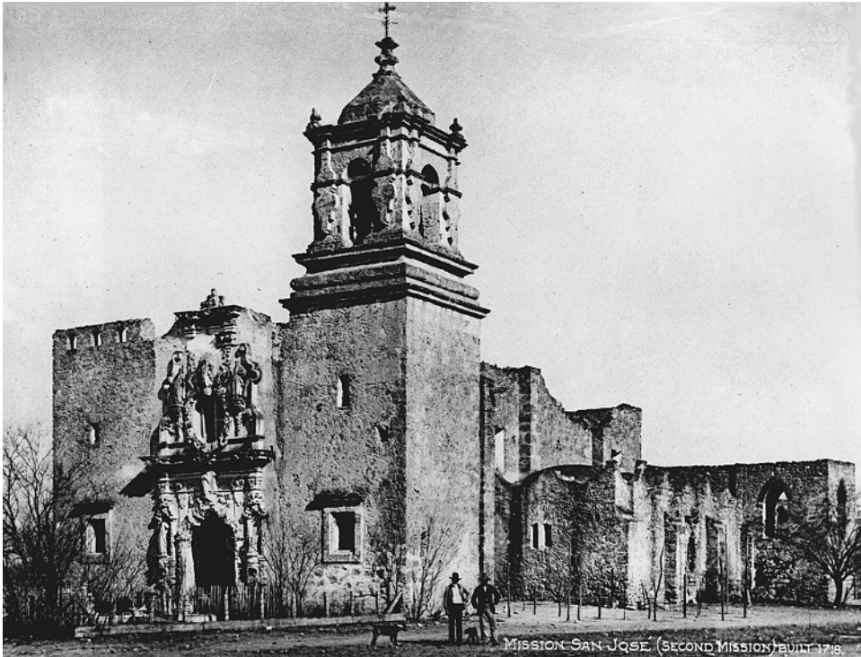
Figure 1.6 Mission San José, San Antonio, Texas

or the Dominicans) staffed the missions, performing various functions relevant to exploration, conquest, and Christianization (Figure 1.6). The missionaries sought to convert the Indians to Catholicism, establish friendly relations with hostile tribes, and, by their fortified presence at the mission, assist in retaining conquered territories for the Crown.