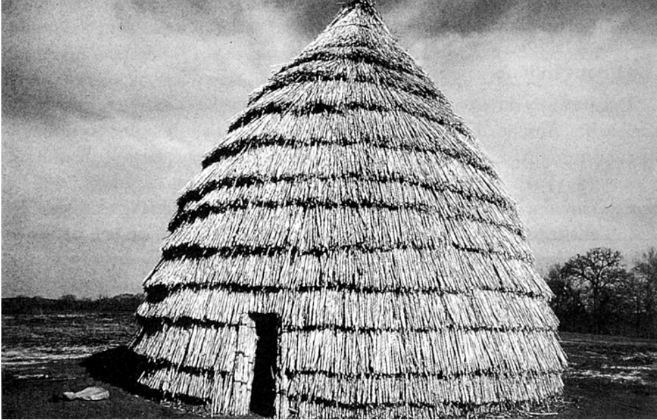
Figure 1.2 Over 1,200 years ago, a group of Caddo Indians known as the Hasinai, who were part of the great Mound Builder culture of the southeast, built a village and ceremonial center 26 miles west of present-day Nacogdoches. Shown here is a reproduction of a typical Caddo house like those found here at this Mound site.