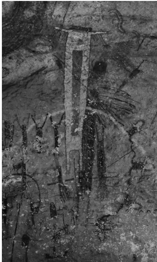
Figure 1.1 White Shaman. Cave art of the prehistoric inhabitants of the Pecos River area. Credit: Amistad National Recreation Area.

A third advanced culture group that flourished at the time of Europeans’ arrival in the Western Hemisphere was located roughly from what is now West Texas to Arizona, and north as far as southern Colorado. Here the Hopi and Zuñi created a distinctive cultural heritage (Figure 1.1). These tribes, who belonged to a group that Spaniards referred to collectively as Pueblos, resided in planned towns consisting of stacked, apartment-type complexes, sometimes two or more stories high. For defensive purposes, the Pueblos built their adobe villages into rock walls or upon steep mesas and structured them so as to oversee the spacious streets and squares below. In the fifteenth century, the Pueblos cultivated corn and other crops, developed irrigation canals, used cotton to make clothing, and lived much in the same manner as did the European peasant of the same period.