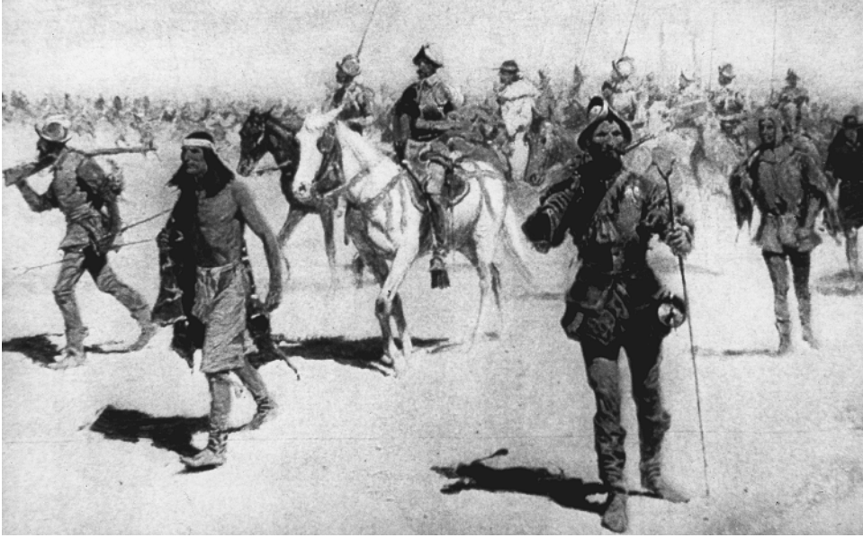
Figure 1.5 Coronado on the High Plains by Frederic Remington. Copied from a reproduction in Collier's Magazine , December 9, 1905. University of Texas at San Antonio.

country the next year, only to discover that Niza's glittering cities were, indeed, merely adobe complexes. Conflict soon brewed with the Pueblos, for Coronado and his troops mistreated the villagers and inflicted numerous indignities upon them, even burning some Pueblo people at the stake. After this, newly generated tales of a golden kingdom called Gran Quivira induced other parties of Spaniards to venture out upon the Great Plains, but as they crossed what we know today as the Texas Panhandle, none saw anything of value to themselves or the Crown.