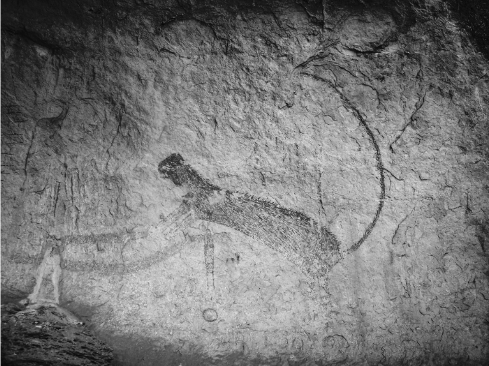
Figure 1.3 This famous panther is an outstanding example of the prehistoric art of the Lower Pecos people.

sometime in the seventeenth century—for what were most certainly Jumano settlements (many of them temporary) have been found beyond the fertile river valleys. In any case, the Jumano civilization stretched from eastern New Mexico and perhaps into Oklahoma, and south to northern Chihuahua in Mexico, with its easternmost appendage extending into the South Plains. In these hinterlands, they made a living by farming and hunting.